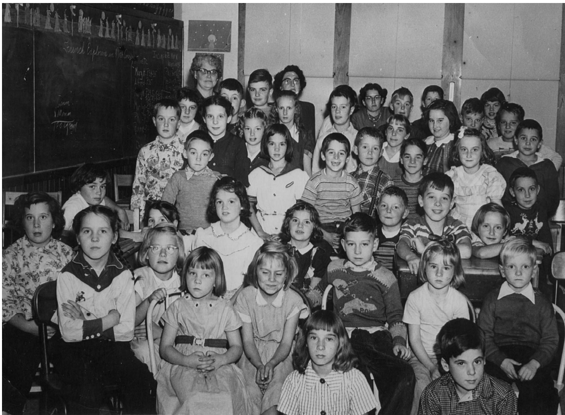
GRADES 1-8 AT THE LYME CENTER SCHOOL (CA 1953)