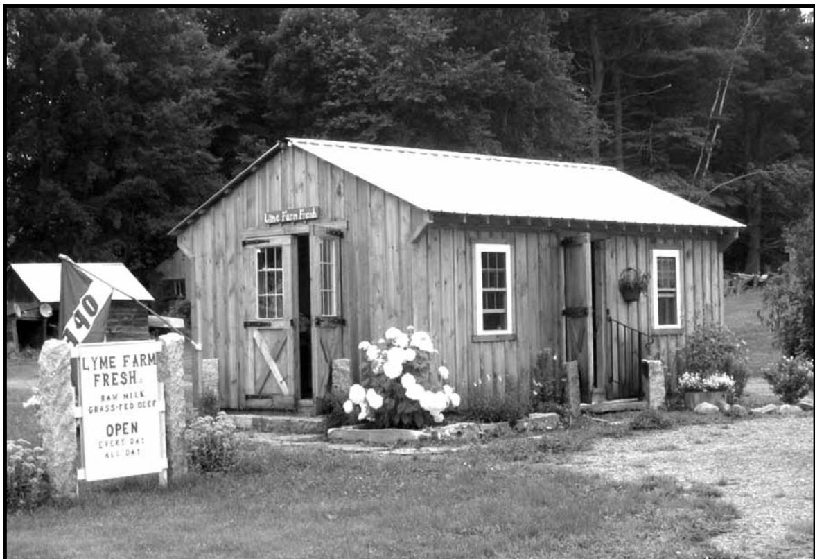
FARM STAND ON RIVER ROAD