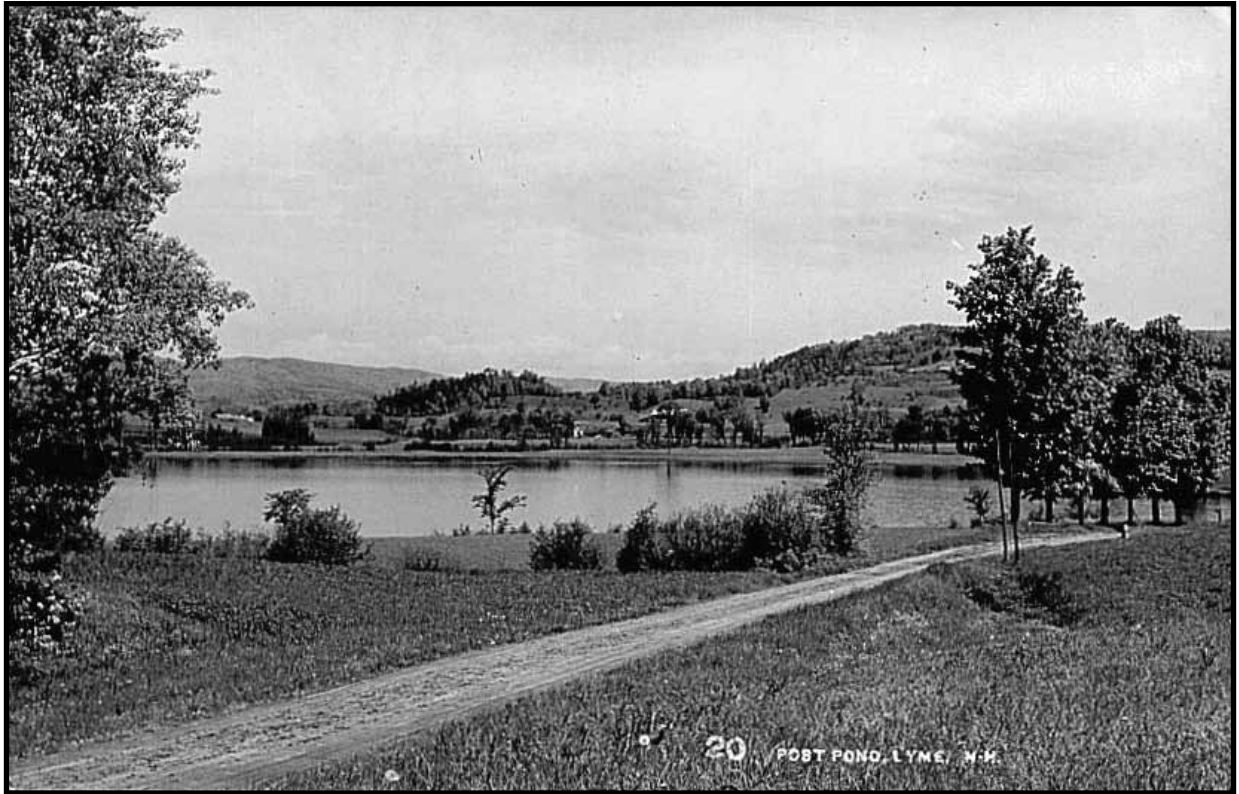
POST POND